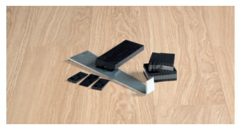
Installation set QSTOOLA Allows easy and professional installation.

To enjoy a full warranty, use only Uniclic installation kit, recommended underlay and cleaning product.