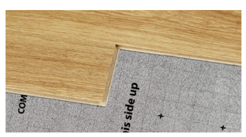
Underlay C-LAY20 or C-LAY50 Combi-Lay Standard combines the right balance of noise reduction, compression, slip and damp proof characteristics into one affordable package. Available in 20 and 50m<sup>2</sup> rolls x 2mm