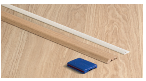
Incizo profile QSINCP(-) Multi functional finishing accessory. 215 x 4.8 x 1.3cm