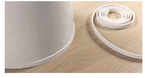
Flexible skirting QSFLEXSKR Provides a perfect finish around pillars and curved walls. 700 x 1.4 x 4cm