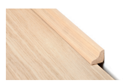
Scotia QFSCOT(-) Closely colour matched trims for a perfect finish. 240 x 1.7 x 1.7cm

Clix Laminate offers a complete solution with closely matching accessories for a beautiful finish of your floor.